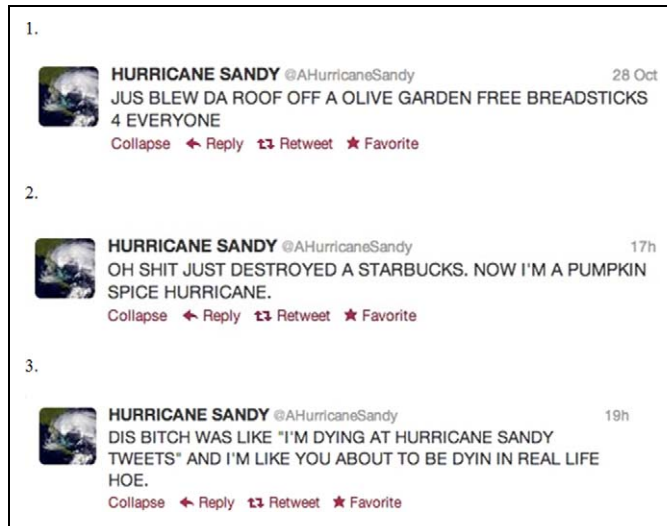
Figure 1. The three tweets posted from the twitter.com account @AHurricaneSandy on October 28, 2012, and October 29, 2012 used as stimuli.