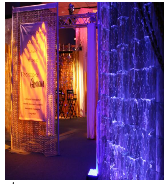
*examples from other events