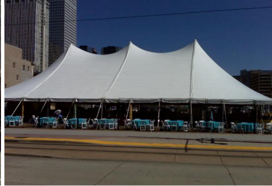
*examples from other events