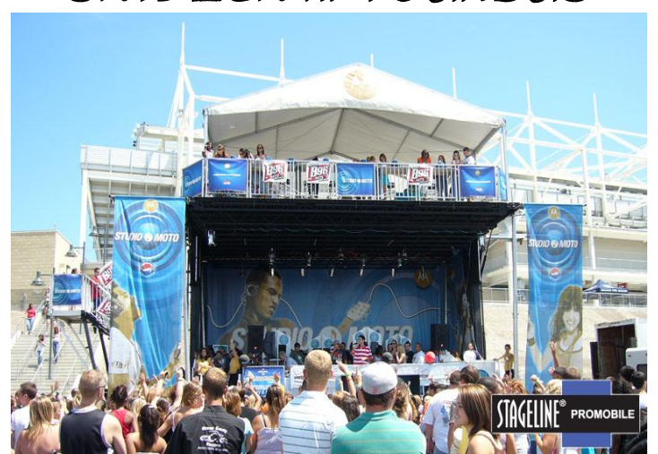
PROMOBILE 21 EVEL STAGE