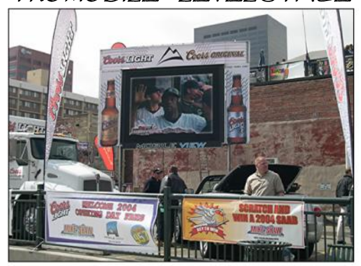
MOBILE LED VIDEO SCREEN